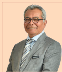
Minister of Entrepreneur Development and Cooperatives YB Datuk Seri Mohd Redzuan Yusof