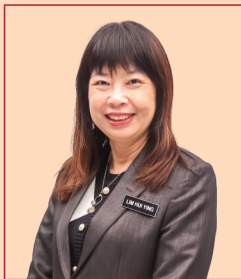
Deputy Minister of Finance YB Lim Hui Ying