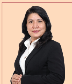
YB Senator Puan Saraswathy a/p Kandasami