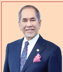
Minister of Entrepreneur Development and Cooperatives YB Dato Sri Dr. Haji Wan Junaidi bin Tuanku Jaafar