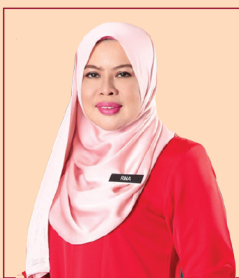
Minister of Rural Development YB Datuk Seri Rina Mohd Harun