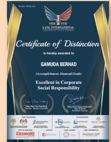
Certificate of Distinction