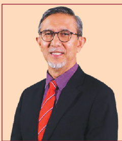
Deputy Speaker of Parliament & Advisor of LICTA YB Dato' Haji Mohd Rashid Hasnon