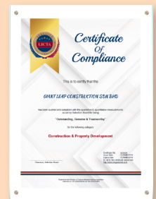
Certificate of Compliance