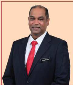
Deputy Minister of Entrepreneur Development and Cooperatives YB Dato' Sri Ramanan Ramakrishnan