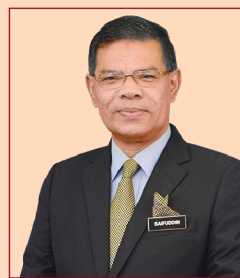
Minister of Domestic Trade and Consumer Affairs YB Datuk Seri Saifuddin Nasution Ismail