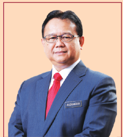
YB Dato Sri Alexander Nanta Linggi