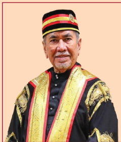
YB Senator Tan Sri Dato Sri Dr. Haji Wan Junaidi bin Tuanku Jaafar