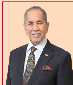
YB Dato Sri Dr. Haji Wan Junaidi bin Tuanku Jaafar