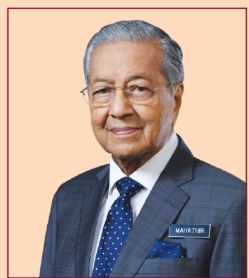
Prime Minister of Malaysia Tun Dr. Mahathir Mohamad